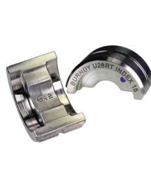
U28RT Die Set