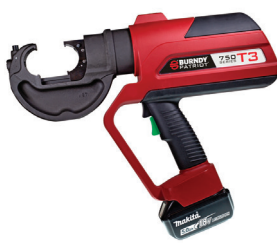
750 Series Tool